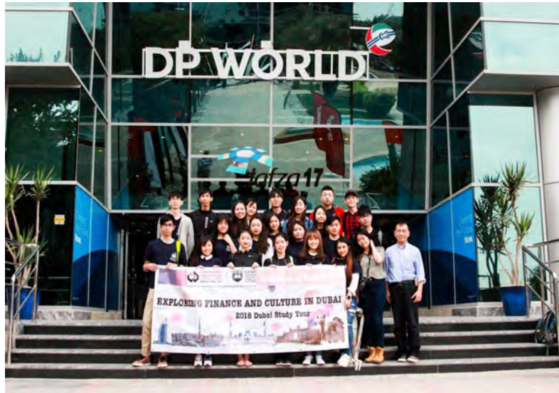
●Group photo in front of DP World

methods to enhance supply chain efficiency of its customers. Apart from that, they strengthen global supply chains by expanding their portfolio of world-class infrastructure assets. Even though we just spend a few time here, we have already had an eye-opening experience and broadening our horizon. We would like to thank DP world for their hospitality and all the rewarding experiences. Last but not least, the tour would not have been possible without the co-ordination and preparatory groundwork undertaken by our tour mate.