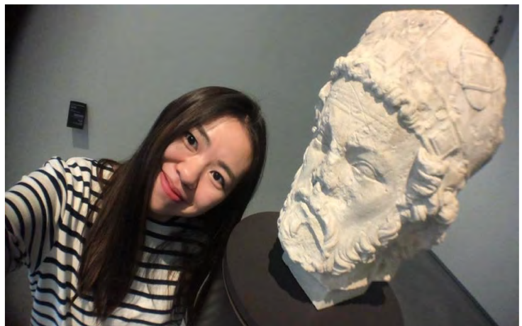
●Let take a selfie with the Head of a bishop