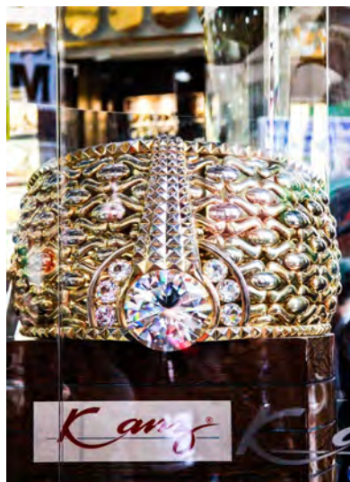
●the largest gold ring in the world

Walking into the Gold Souk, it is eye-opening to see that every store's window filled up with jewelry that made of gold. Not only using a huge amount of jewels to catch customers' eyes, stores will also have some statement pieces to make their store stand out, for example, belly button-length necklaces, a gold corsets and thick gold bangles.