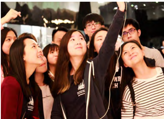
●starting the show

At night, we visited the tallest building in the world. Burj Khalifa is 808 m (2,651 ft) tall and 165 floors. There is a highest outdoor observation deck in the world. At the top, we step into level 125 of Burj Khalifa where we enjoyed a vibrant night scene. It shows that Dubai is the glitzy city for everyone. Under the town, we appreciated the unique design of Burj Khalifa which is inspired by the spider flower of the desert (Hymenocallis). After that, the fountain show brought the brilliant performance of lights, music and water columns. The show is started at sunset and repeated every 30 minutes. With the play of light, music and water geysers, we marveled the captivating view.