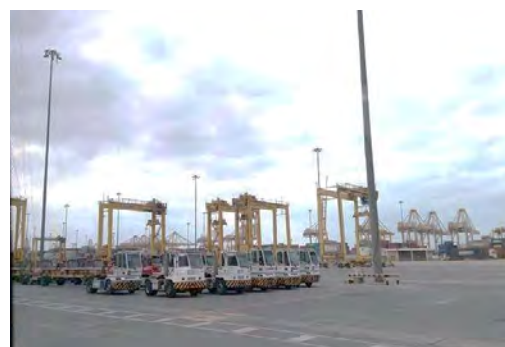
●The Yellow Column in DP World is generally doing the cargo service.