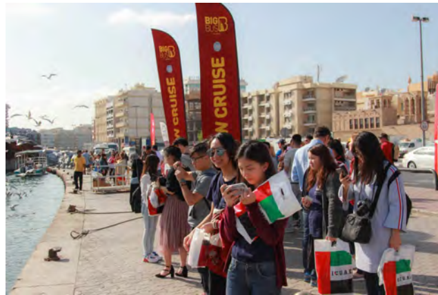
●waiting the water taxi

After taking a glance at the traditional way of life in Dubai Museum, we crossed the Dubai Creek by water taxis called abras and went to the Gold Souk and Spice Souk to see a traditional market in real life.