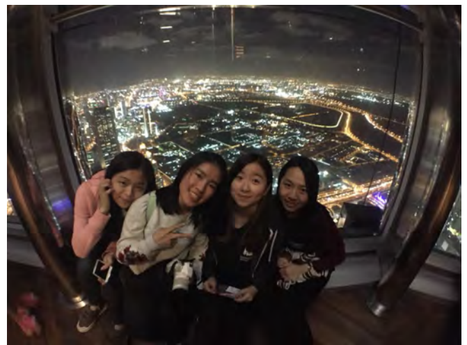
●We were enchanted by the night scene.